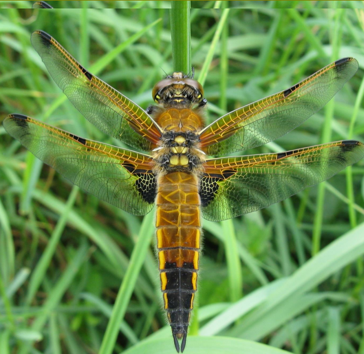
Four-spotted Chaser ( Libellula quadrimaculata )