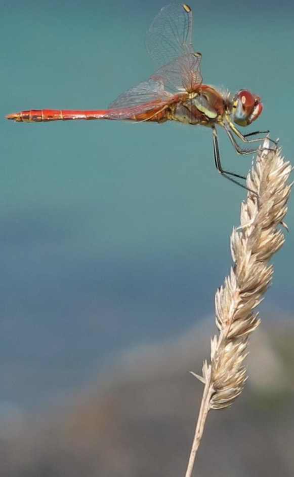
Red-veined Darter ( Sympetrum fonscolombii ) male