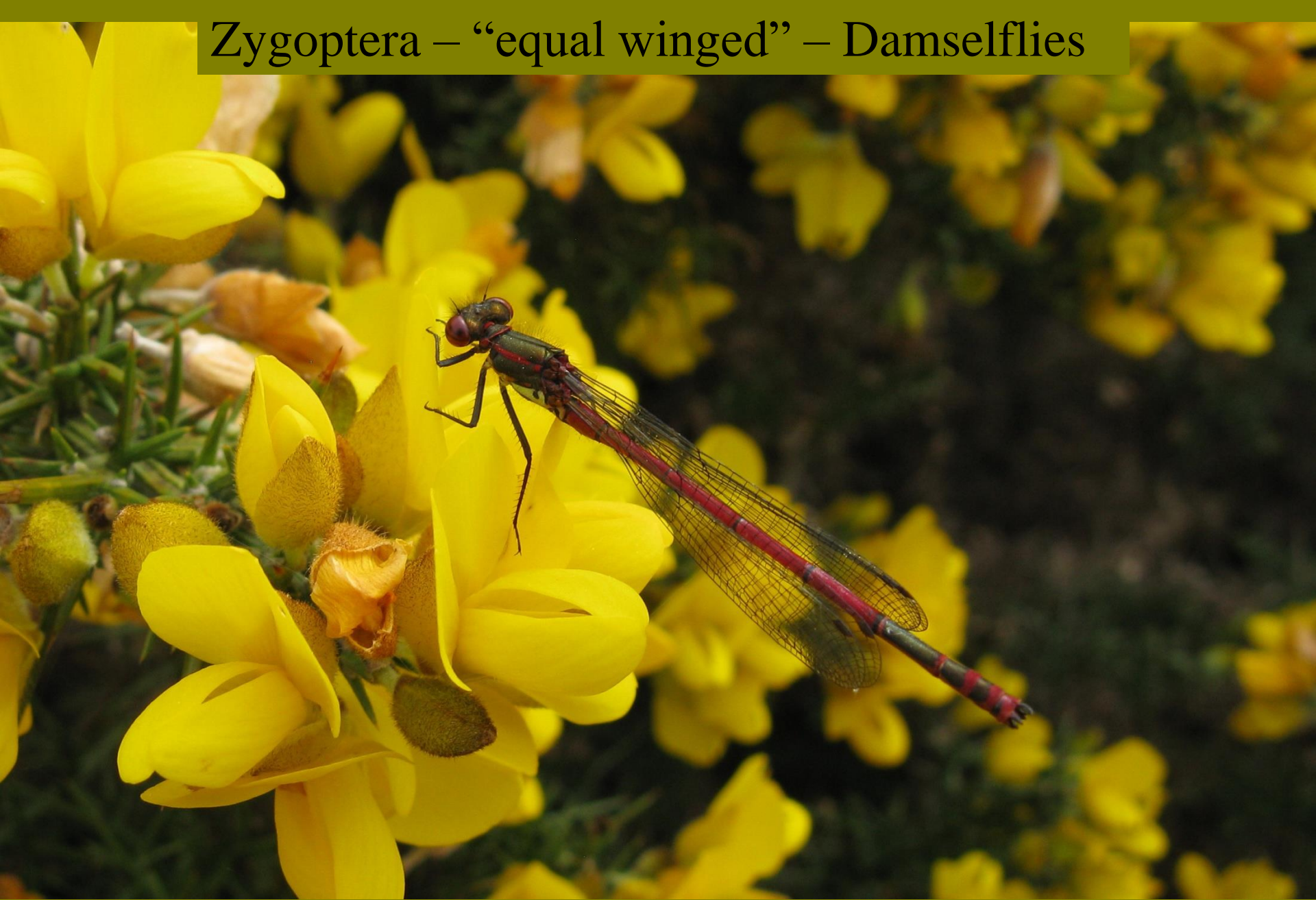
Large Red Damselfly ( Pyrrhosoma nymphula ) male