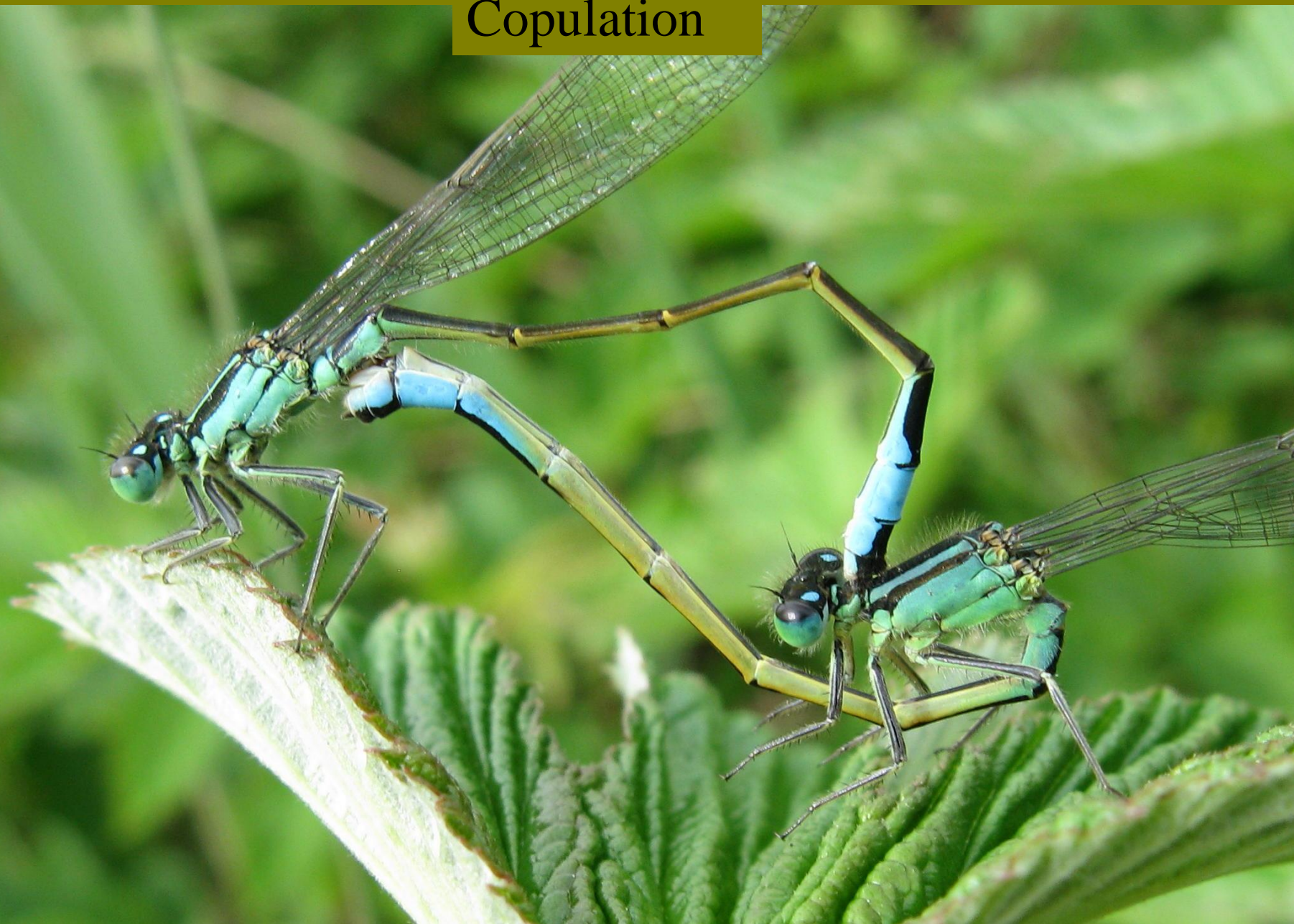
Blue-tailed Damselfly ( Ischnura elegans )