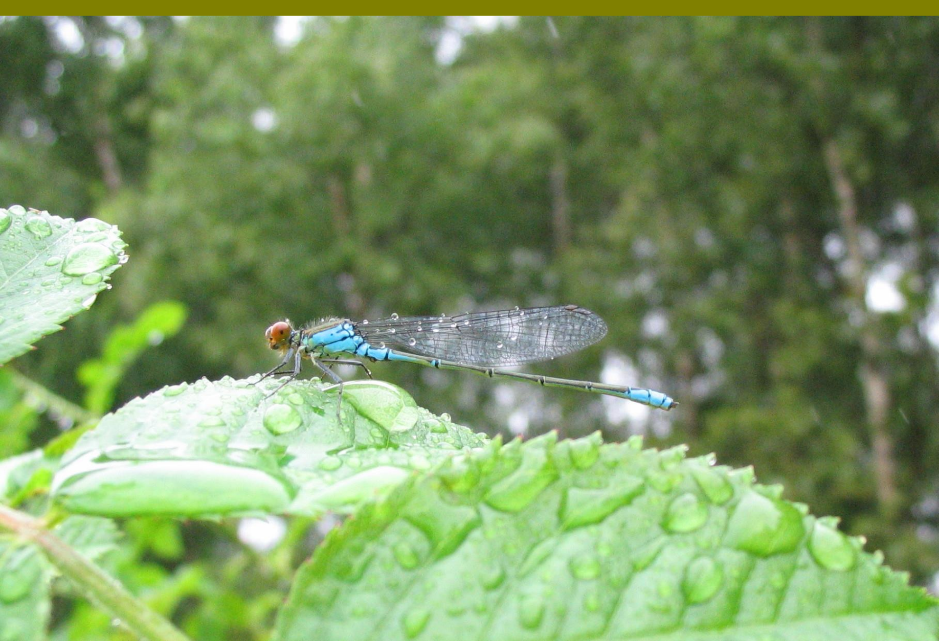
Small Red-eyed Damselfly ( Erythromma viridulum ) male