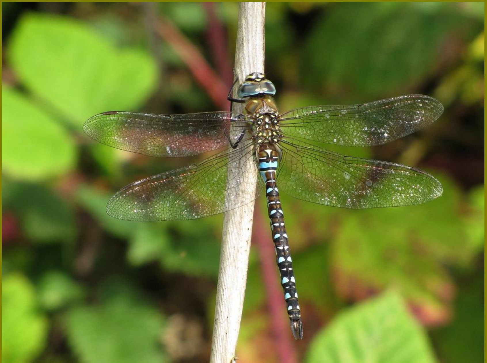
Migrant Hawker ( Aeshna mixta ) male